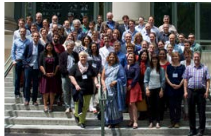
Photo: 2015 SDN Meeting.

The 14th Annual Meeting of the Science and Democracy Network was held at Harvard Law School, June 25-27, 2015, with generous support from the Institute for Global Law and Policy. This year's meeting included pre-circulated papers on a variety of topics such as chemical testing on children, climate knowledge in South America, GMOs and Indian democracy, translational medicine, and theoretical aspects of sociotechnical imaginaries and biopolitics. In order to accommodate more speakers, the meeting also featured a panel of eight shorter presentations exploring diverse uses and understandings of the concept of co-production.